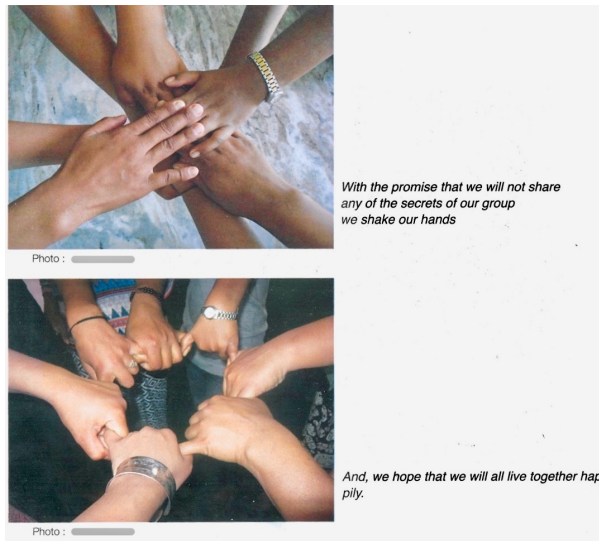
Fig. 2. The sister-survivors used different angles and compositional techniques to hide their identity in the photo-book.