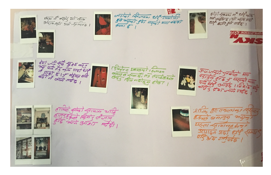
Figure 1: The two posters created during the social photo-elicitation session were placed on SO's office walls, showcasing sister-survivors' work for the staff members and visitors.

technology introduction had done just this. Twelve sister-survivors had been taught Photoshop during a two-week introduction. They found the experience overwhelming and reported that they did not learn much. One sister-survivor shared, "... when we were learning to edit [photos], we had never touched a laptop before to know anything."