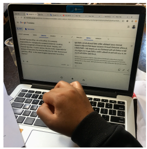
(b) A sister-survivor translating the Wikipedia page on chief financial officer

Figure 2: We began by uncovering and reflection on the assets available to the sister-survivors. (a) We then built on the identified assets using a tailored web application. (b) We extended the exploration to introduce widely available systems such as Google Search and Google Translate, and Wikipedia.